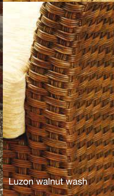
Luzon walnut wash