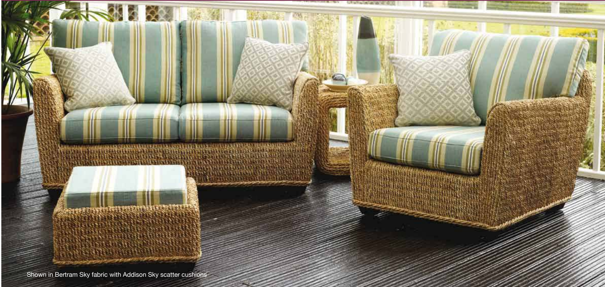
Shown in Bertram Sky fabric with Addison Sky scatter cushions

The Copacabana Range is both compact and extremely comfortable. Made from highly durable double twist natural banana leaf with a range of fabrics available as well as co-ordinated accessories including a coffee table, lift top chest for secret storage and a footstool.