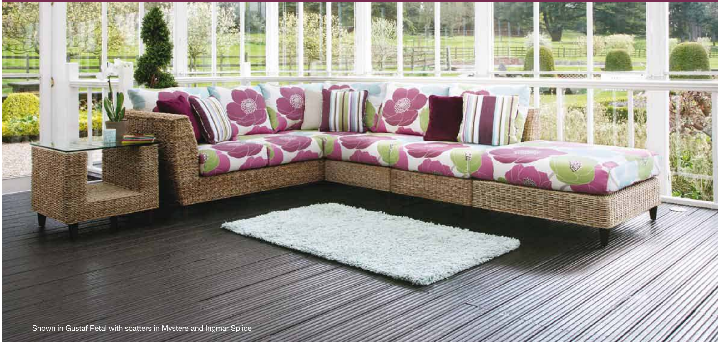
Shown in Gustaf Petal with scatters in Mystere and Ingmar Splice

Go as big or small as you like, this collection offers everything the Sea Breeze does but with a large number of pieces to provide a flexible seating combination to suit every home.