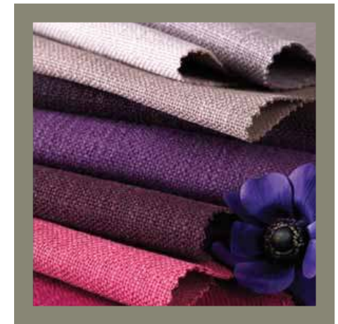
OSBORNE & LITTLE

Guarantee Choose Ocean Designs with confidence. We build to exacting quality standards, conform to all the relevant British Standards and are pleased to offer a comprehensive 12 month guarantee against any manufacturing fault.