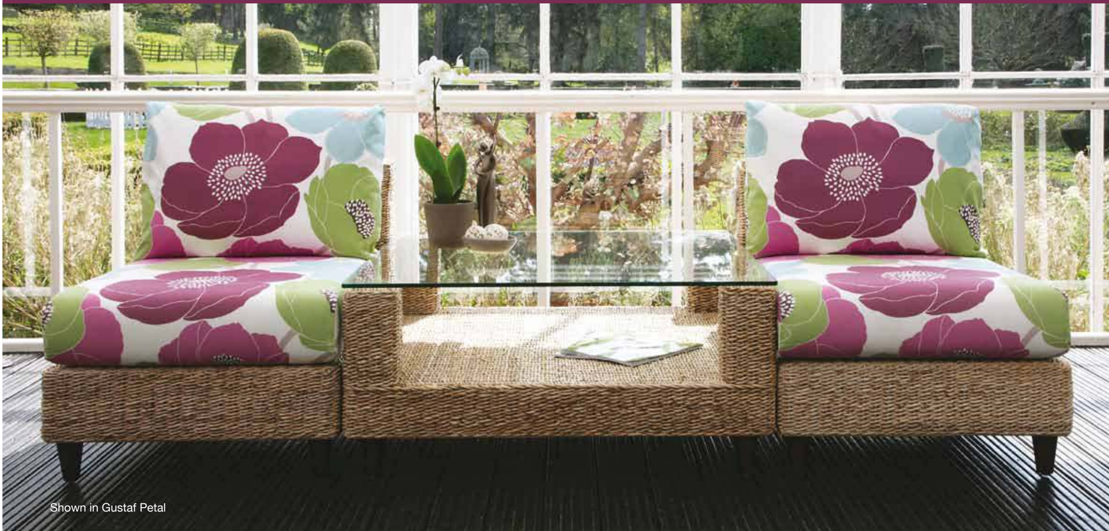
Shown in Gustaf Petal

The armless chair is the perfect compliment to the corner range, either used in conjunction with the Sea Breeze or Sea Breeze Corner ... or on it's own.