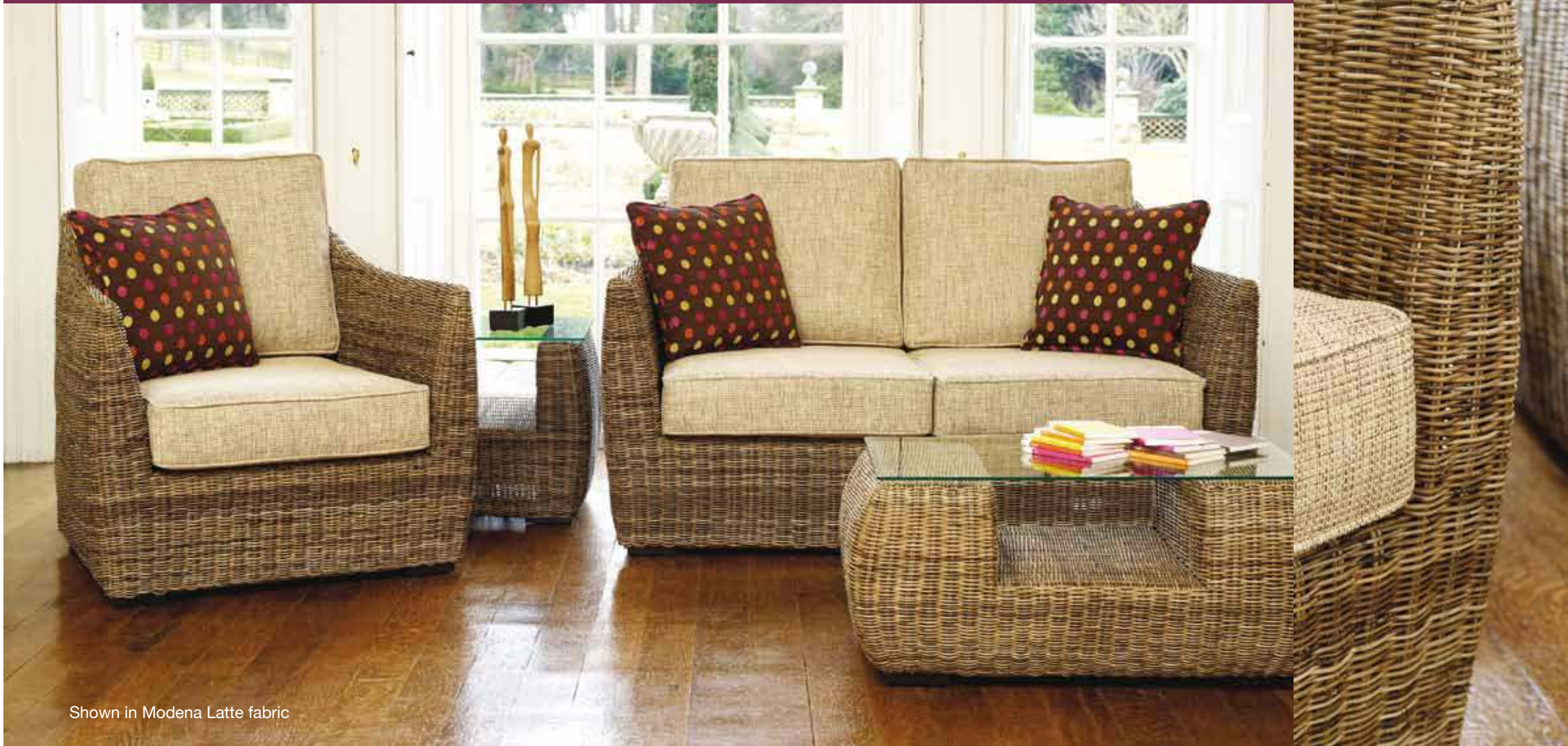
Shown in Modena Latte fabric

The Bay Range is woven in natural pullet with beautiful variations in colour and shade. Choose from a large two seater sofa, the smaller medium sofa, chair, coffee table, lamp table and storage chest.