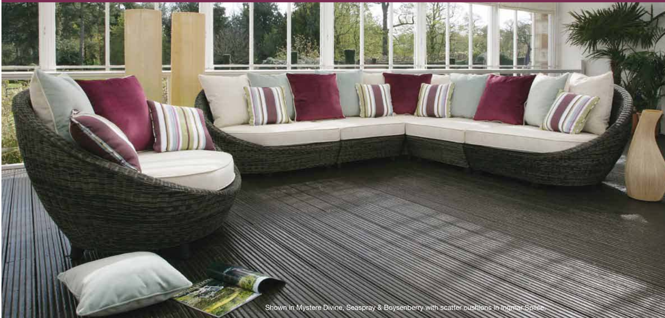
Shown in Mystere Divine, Seaspray & Boysenberry with scatter cushions in Ingmar Spice.

Go as big or small as you like, this collection offers everything the Drift range does but with a large number of modular pieces to provide a flexible seating combination to suit every home.