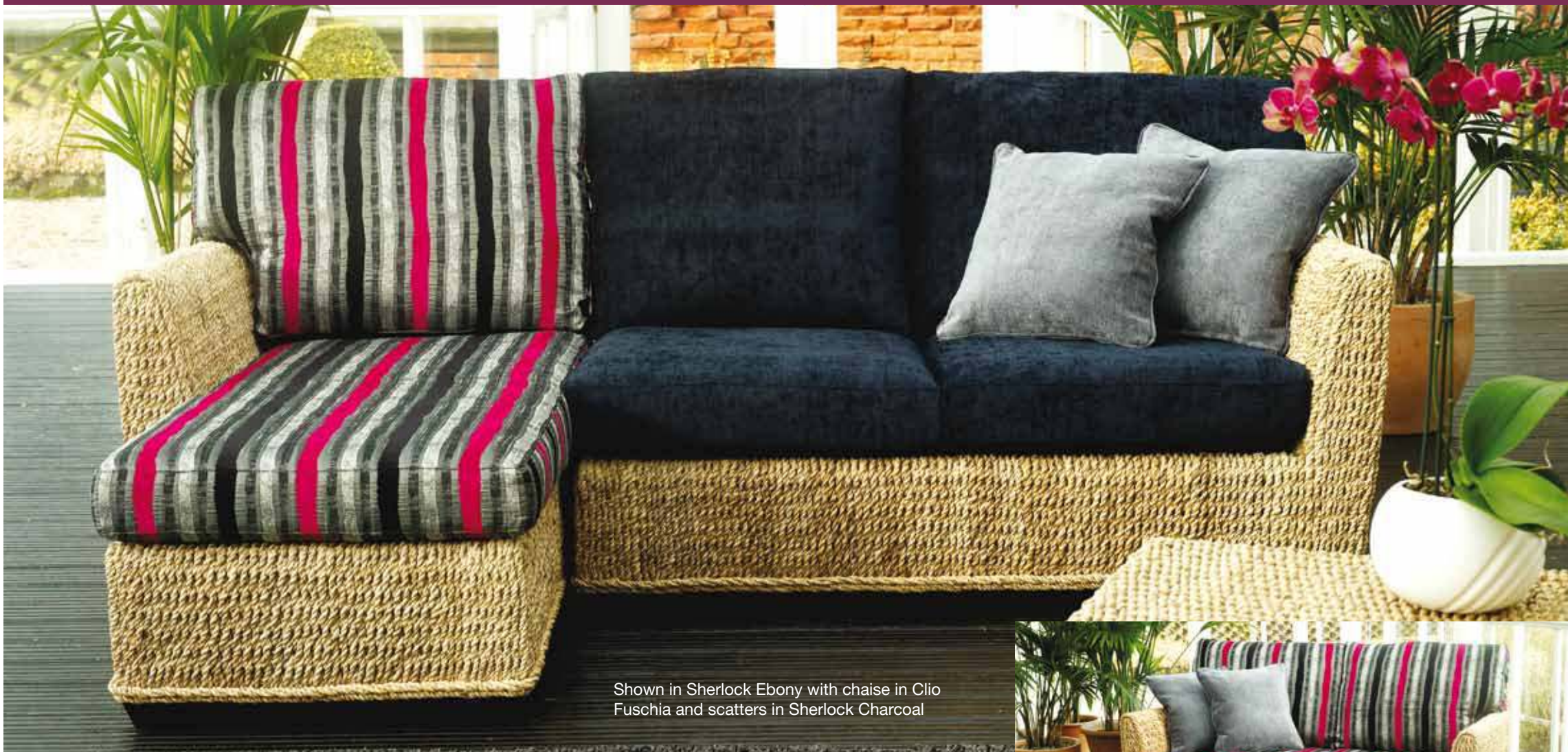
Shown in Sherlock Ebony with chaise in Clio Fuschia and scatters in Sherlock Charcoal

Create a chaise longue or day bed for a more relaxed seating style.