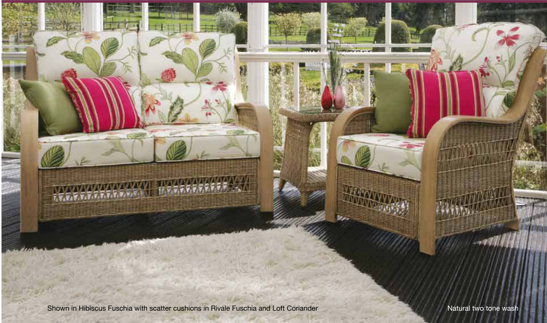
Shown in Hibiscus Fuschia with scatter cushions in Rivale Fuschia and Loft Coriander

High backed style with lumbar support, the smooth arm design is ergonomically positioned for the perfect sit.