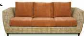
2 Seater sofa