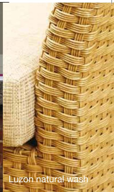
Luzon natural wash